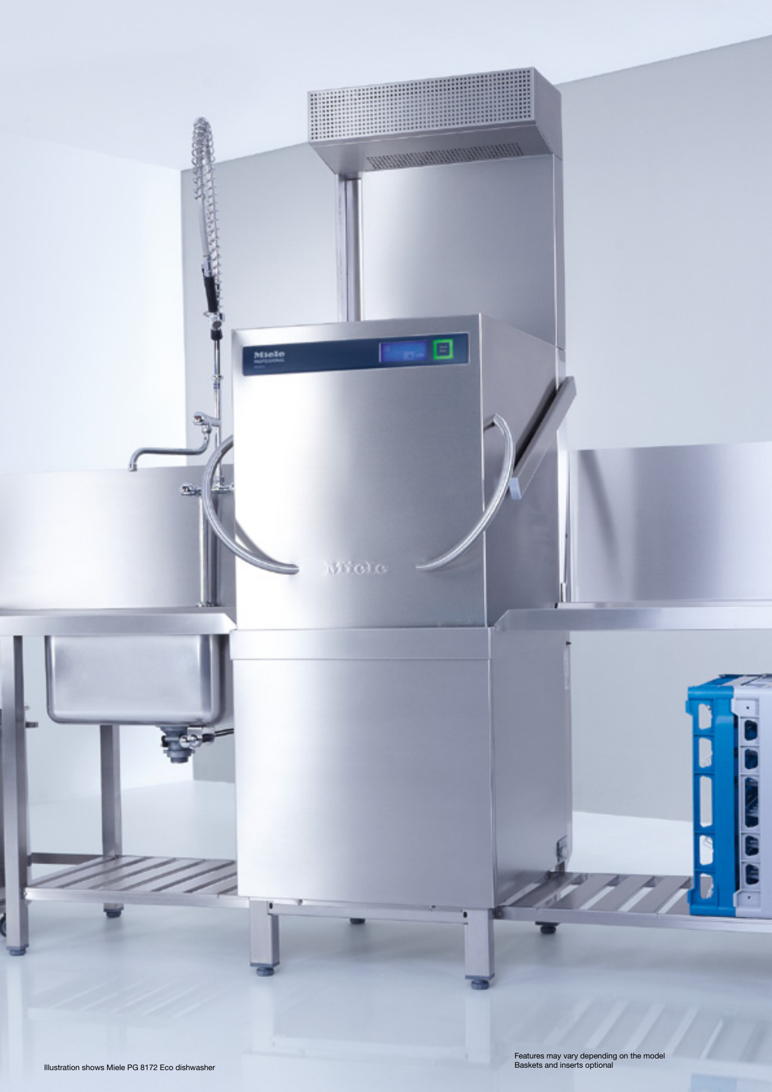
Illustration shows Miele PG 8172 Eco dishwasher

Features may vary depending on the model Baskets and inserts optional